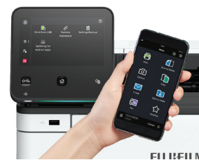
Print from mobile devices